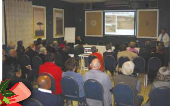
Guests at our Abbeyfield 2011 AGM