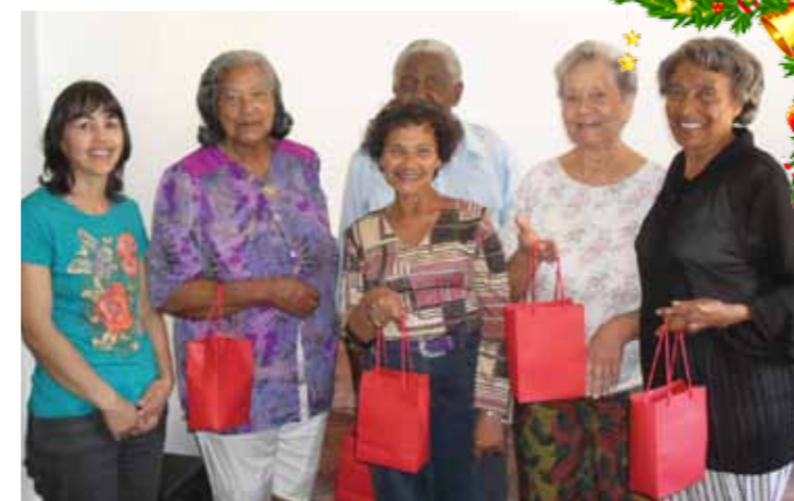
Abbeyfield residents with Xmas gifts from Head Office