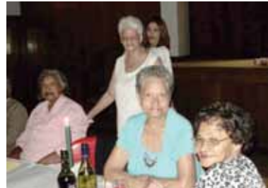
Residents and committee members enjoying the dinner dance