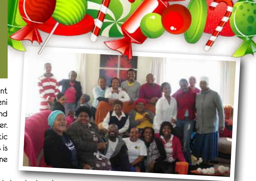
Ethembeni residents with volunteer church members

Youth members from the 7th Day Adventist Church spent a day out in the community chatting to our Ethembeni residents, keeping them company and telling stories and then made them all a big lunch which they shared together. What a lovely thing for a group of young and enthusiastic men and women to do. Listening to stories of our elders is such an important way of passing on knowledge from one generation to the next.