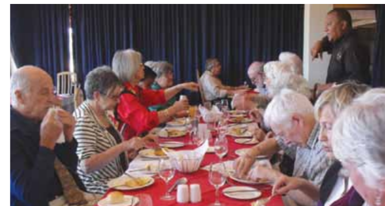
Enjoying Christmas lunch at the Mowbray Golf Club