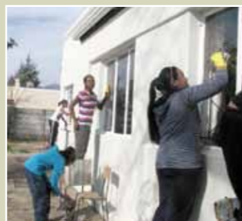
Learners hard at work on the windows