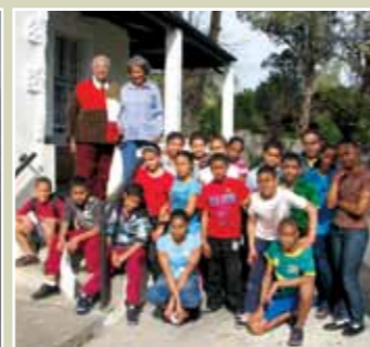
Grade 7 Ebenezer Primary outside House of Grace