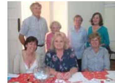
Some Wyndover committee members and residents

Congratulations to Wyndover and the Hout Bay Local Society for organising two successful bridge drives this year for their Abbeyfield homes. These events are a great way of bringing people together and spreading the word about Abbeyfield. They not only bring in much needed money for the houses - usually for repairs and maintenance - but also to raise awareness about Abbeyfield in the community and the work that we're involved in. Congratulations!