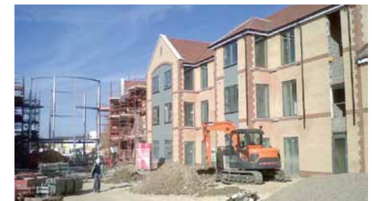
The new Abbeyfield Girton development in Cambridge

Girton, also in Cambridge, is a new Abbeyfield development with 76 units, 1, 2 and 3 bedroom apartments. These homes offer residents the opportunity to live life independently with the knowledge that if and when they need assistance, there is a dedicated team on hand to provide it.