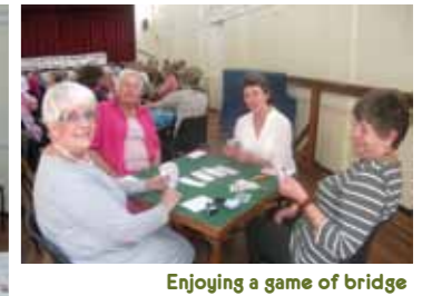
Enjoying a game of bridge