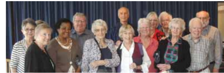
Sutherland houses committee members and residents

Sutherland House committee members treated their residents to a Christmas lunch at the Mowbray Golf Club on Sunday, 27th November. Residents enjoyed a delicious roast and were treated to a gift each from the committee. What was unexpected was that residents then handed out gifts to each member of their committee. Well done Sutherland House such a great gesture! To all our other Local Societies that are doing something celebratory for their residents for Xmas, a big thank you to you!