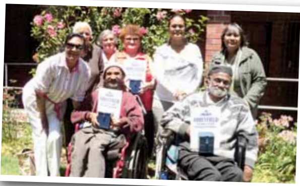
Some Ons Huisie residents and committee members

This year we had 3 of our houses participate in street collections. Well done to Ocean View, Plumstead and Macassar committees and residents for doing your bit to raise funds for your Abbeyfield home.